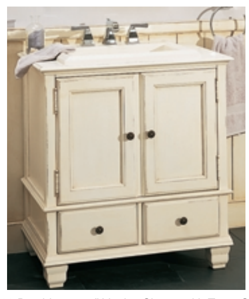
9432.200 Providence 32" Vanity. Shown with Town Square Countertop and Town Square faucet.

NOTE: The above are photographs of the Providence Marble Vanity Top and is to be only used as a guide for selection. Marble is a natural product and as such may vary in shading and texture. Viewing Marble Tops on display at a local AMSTD. Dealer is recommended.